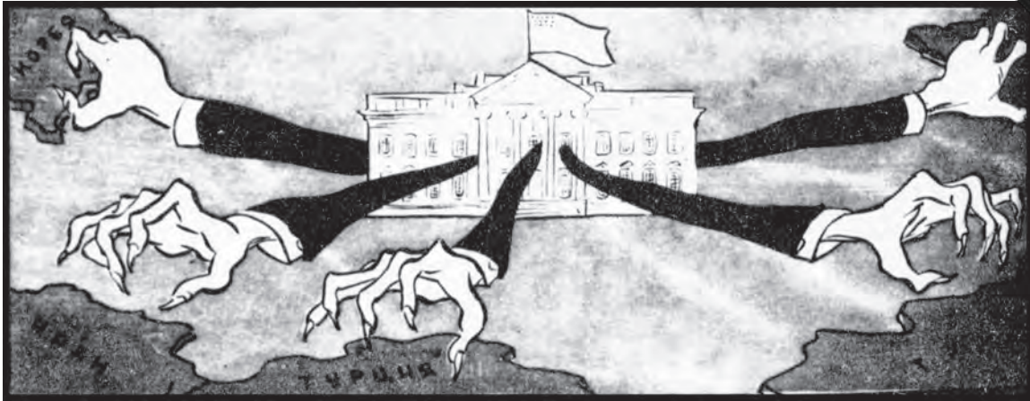
A Soviet cartoon published in 1950. The building represents the White House where the American President lives and works.